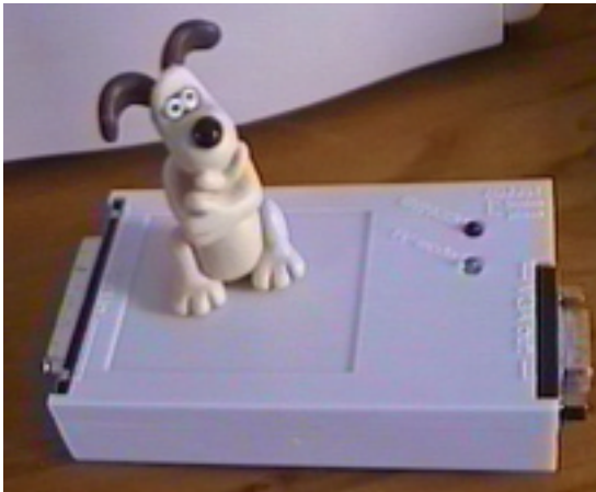
The MV1200 Scan-doubler unit

The MV1200 scan-doubler doubles the normal 15khz video output of the Amiga to the 31khz VGA standard, thus enabling you to use a VGA monitor with your Amiga and still have all Amiga video modes available. This particular unit also comes with a flicker-fixer option to enable a flicker free display of interlaced pal and ntsc screens. The unit uses a PLL circuit for pixel clock generation, therefore making it compatible with all Amiga (OCS, ECS & AGA) chipsets and both PAL & NTSC video modes.